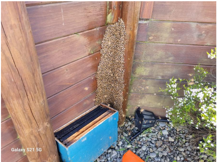
Galaxy S21 5G